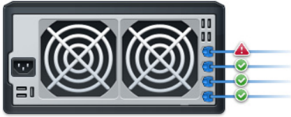
Figure 1) Resilient and Reliable

With multiple redundant LAN ports, DS1813+ is resilient enough to be entrusted with your most mission critical tasks.