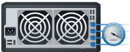
Figure 2) Superior Performance

To protect your critical business data, DS1813+ can become a centralized backup target for consolidating fragmented and unstructured information across your network through a range of options. PC users can backup to DS1813+ with Synology's Data Replicator, while DS1813+ also fully supports Mac OS X's native Apple® Time Machine®. Synology's own backup wizard can back up information to another Synology NAS or any rsync server, with the option of using an encrypted connection, or to an external hard drive via USB 3.0 or eSATA. The wizard can also back up your information to the cloud, including Amazon® S3, Glacier, and STRATO HiDrive.